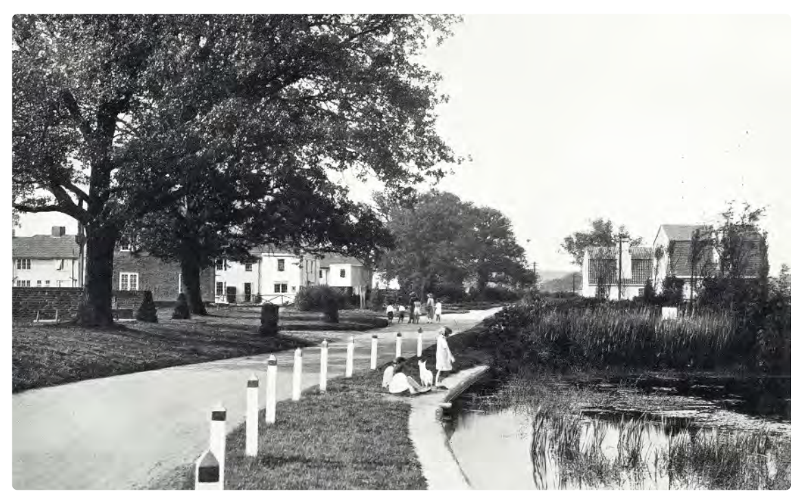
Meadow Green - an illustration from Site Planning in Practice at Welwyn Garden City

trees such as laburnum, thorn, etc., being used. At focal points in the plan large trees have been planted such as beech, lime, chestnut, etc., usually in groups of three or four at street corners, so as to make features in the street pictures in years to come.