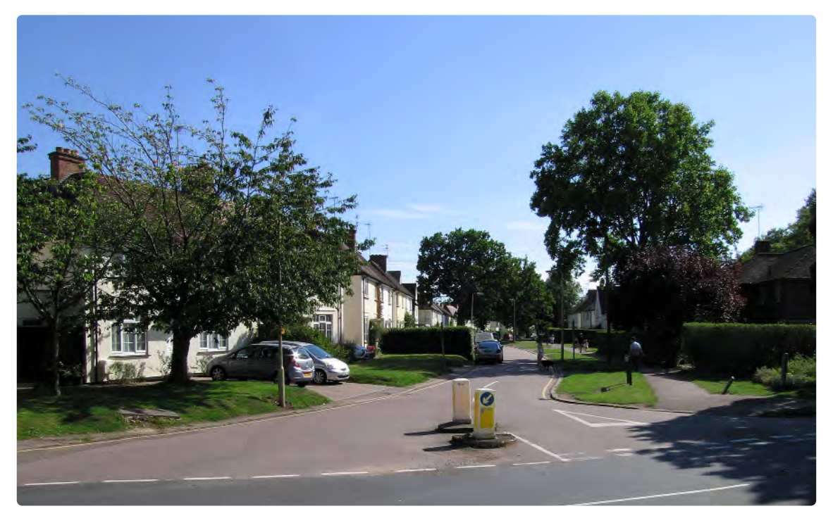
Housing on Handside Lane, Welwyn Garden City today (above), and the same view shortly after completion of houses in 1925 (right)

definite scheme. This, of course, is the antithesis of the prevailing manner in which other towns have grown and still extend, and the results are likely to be different from what are seen elsewhere.